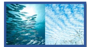
Mackerel sky, mackerel sky, never long wet, never long dry.

Interview a grandparent or farmer or research 'Farmer's Almanac Proverbs'. Observe the clouds over a period of 5-7 days and record observations in your journal. See if the proverbs ring true!